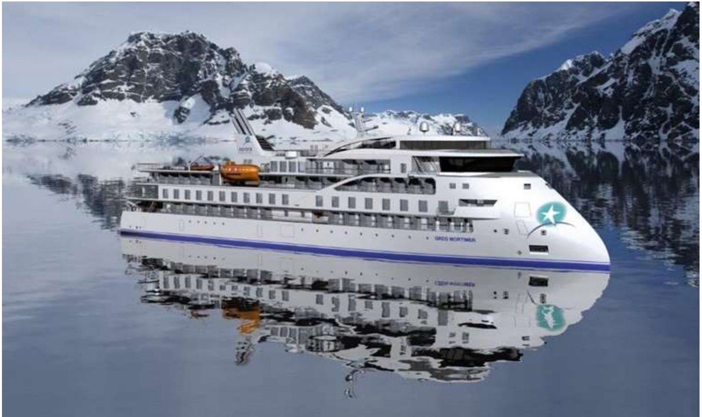
GREG MORTIMER will be the lead ship in the Infinity Class series